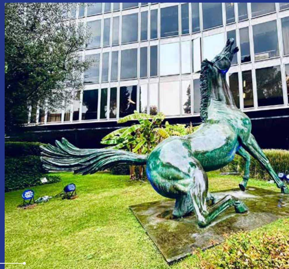
Asbestos removal and redevelopment of the RAI General Directorate on Viale Mazzini in Rome