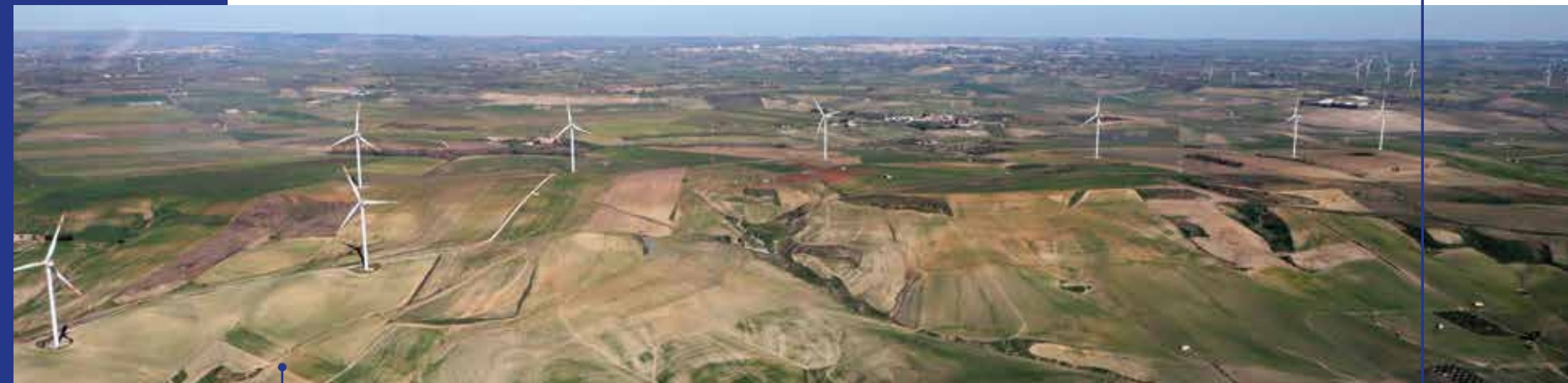
Le Reni Wind Farm, Matera